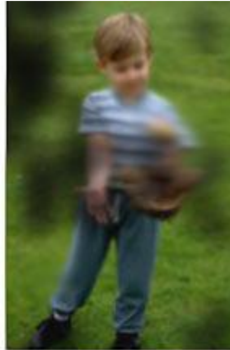
Vision with diabetic retinopathy